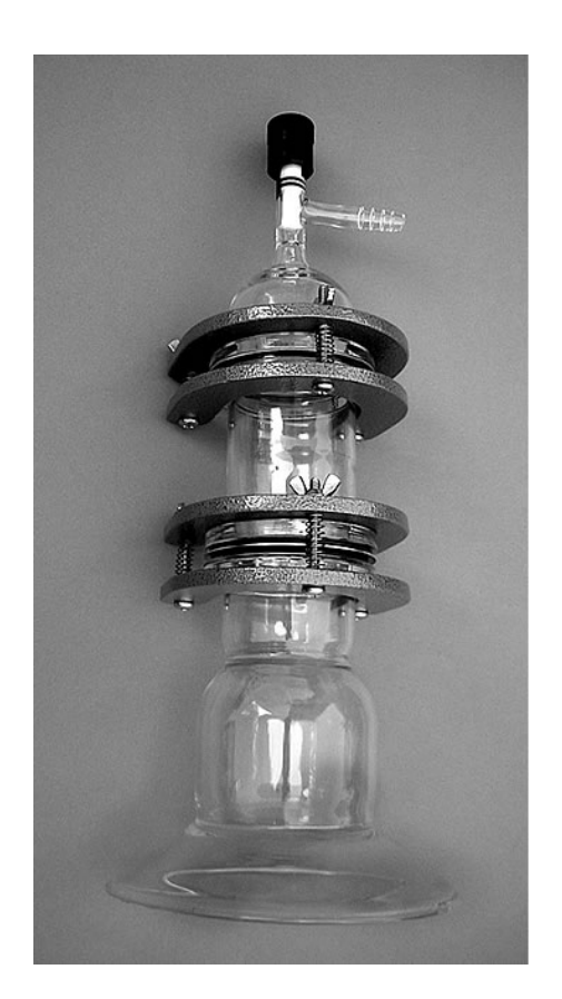
Figure 1. Fully assembled bead-maker with glass parts separated by rubber O-rings and held together by three-point adjustable horseshoe clamps.

hardness of the beads including: the size of the pores through which the sodium alginate is exuded, the concentration of the sodium alginate as well as that of the CaCl<sub>2</sub>, the length of time in which the exuded beads remain within the calcium chloride solution, and physical or electrostatic forces that may be used to drive the extrusion of the beads (Serp et al. 2000; Klokk and Melvik, 2002).