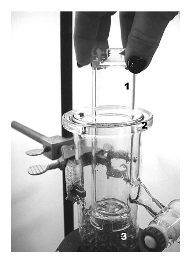
Figure 5. Insertion of a Pyrex® glass adaptor (1) into the flow-cell (2) with the top unit of the assembly removed. Alginate beads may be observed at the bottom of the assembly (3). The use of this adapter reduces the useful volume of the assembly to approx. 30 ml. Other sizes may be used.

beads. A 44% reduction in the amount of phosphorus and a 27% reduction in the amount of lead per mg of beads was recorded by the end of 24 hrs. Additional studies are being conducted on the ability of P. boryanum to sequester and release other metals using the devices described in this report.