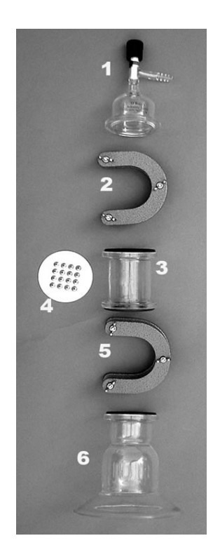
Figure 2. A disassembled bead-maker showing all the component parts.

Equipment design for biosorption studies with microorganisms